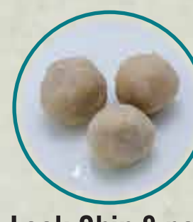
Look Chin 3 pcs $1.5