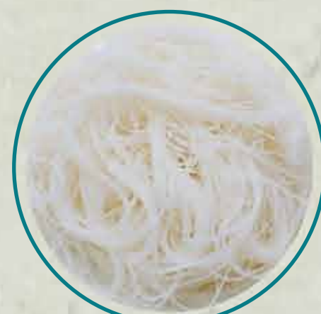
Rice Vermicelli Noodle