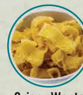
Crispy Wonton $2.5