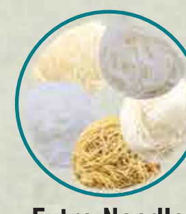
Extra Noodle $2

*** Sunday surcharge 10% | Public Holiday, Christmas EVE & New Year EVE All food and drinks incur a 15% surcharge. ***