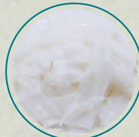
Flat Rice Noodle