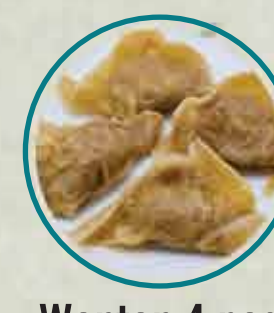
Wonton 4 pcs $3.5