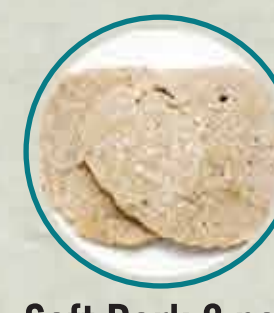
Soft Pork 2 pcs $2