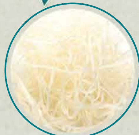
Thin Rice Noodle